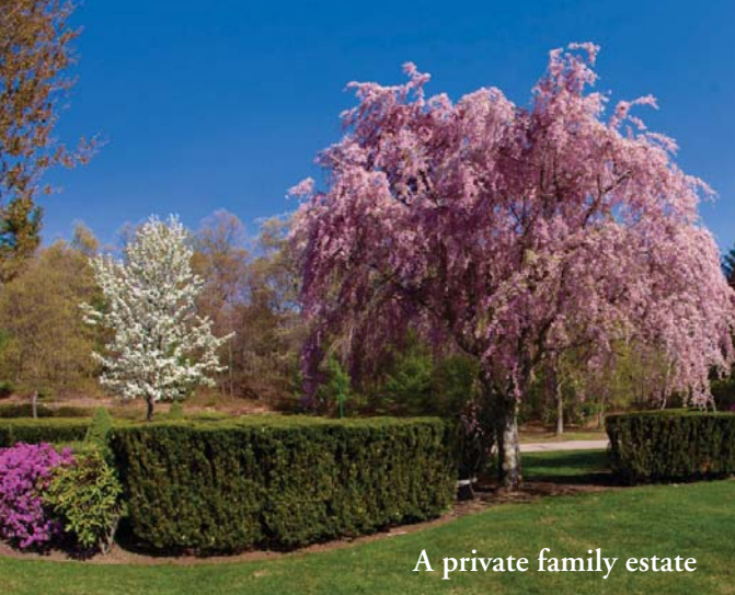
A private family estate