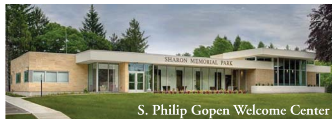
S. Philip Gopen Welcome Center

Choose your section & spaces • Advance Planning Cremation spaces • Interfaith Sections Private Family Estates